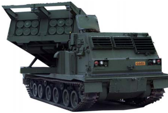
Multiple Launch Rocket System (MLRS)